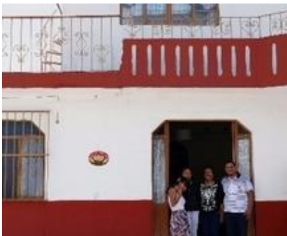
Newest Niños Facility Jireh House - 2017